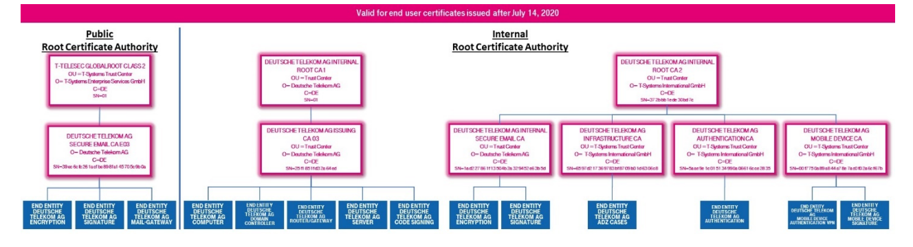
Figure 1: Overview of the "cPKI" service with the root and sub-CAs from the certificate issue date July 14, 2020

Figure 1 shows the currently valid overview of the "cPKI" service with the root and sub-CAs from which certificates are issued from the certificate issue date July 14, 2020 onwards.